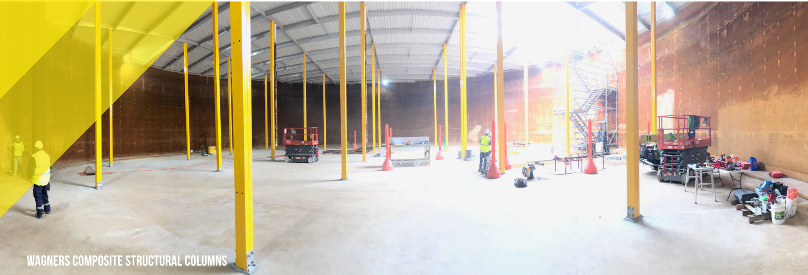
WAGNERS COMPOSITE STRUCTURAL COLUMNS