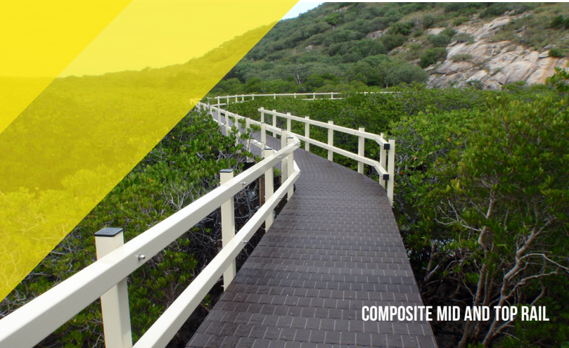
COMPOSITE MID AND TOP RAIL