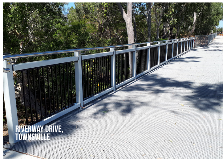
RIVERWAY DRIVE, TOWNSVILLE

WAGNERS COMPOSITE PRODUCTS WILL NOT RUST, ROT OR CORRODE ENSURING A LOW MAINTENANCE ASSET WITH A LONG LIFE SPAN.