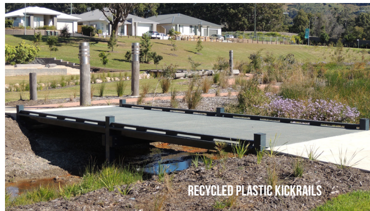
RECYCLED PLASTIC KICKRAILS