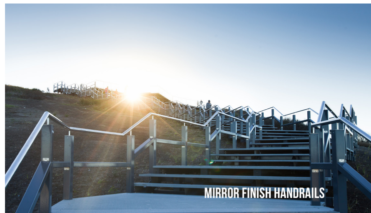
MIRROR FINISH HANDRAILS

ENVIRONMENTALLY FRIENDLY KICKRAILS WITH COMPOSITE OR RECYCLED PLASTIC.